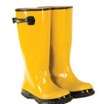
Classic Construction-Grade Rainboots

75-1303 Cold Weather High Visibility Parka/Vest designed to keep out the wet and cold. Available in L-6XL