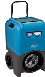
DRI-EAZ LGR 7000

INDUSTRIAL & COMMERCIAL AIR CONDITIONERS AND DEHUMIDIFIERS LARGE AREA UNITS AVAILABLE