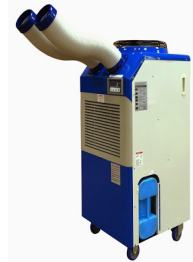
TPI Air Conditioners